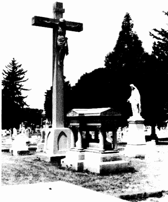
MT. CALVARY CEMETERY, COLUMBUS PRIESTS' CIRCLE

The central fact of all human history, the crucifixion of our Lord, is depicted in the center of Mt. Calvary Cemetery in Columbus by the large crucifix standing in the center of the priests' circle. From the side of our Lord on the Mount flow all graces, as in a river "from the right side of the temple", and so it is fitting that the ordinary ministers of the sacraments be gathered around Him. Since the cemetery office has no record of the priests interred there, we present the inscriptions on their memorials in this issue.