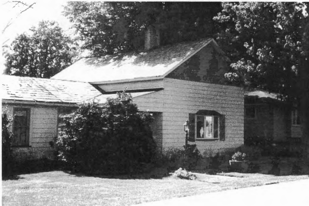
The former St. Matthew/St. Ann Church. A small el was added on the south side decades ago and more recently a large addition was built in the rear.