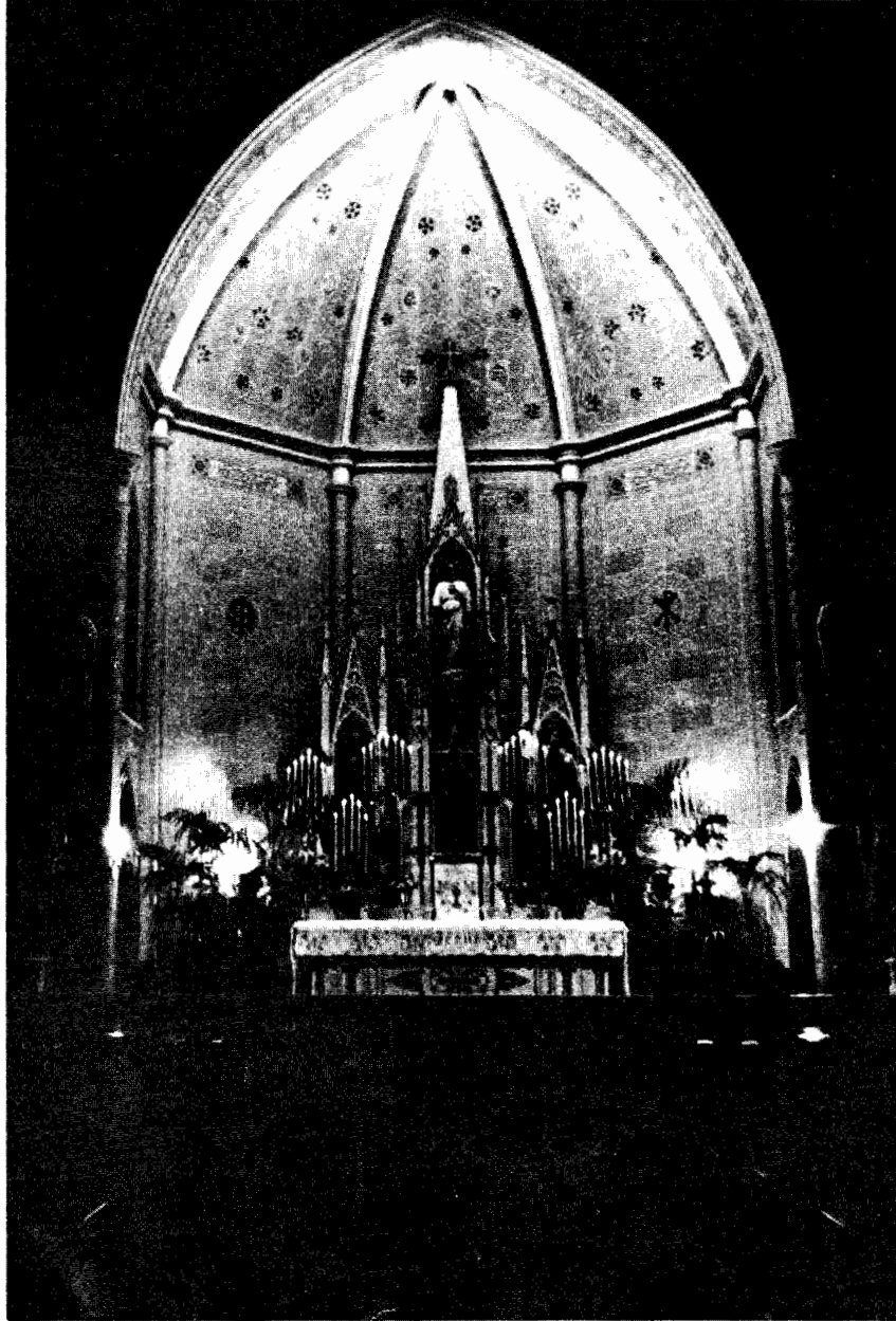
The St. Vincent Chapel, Christmas, 1934.